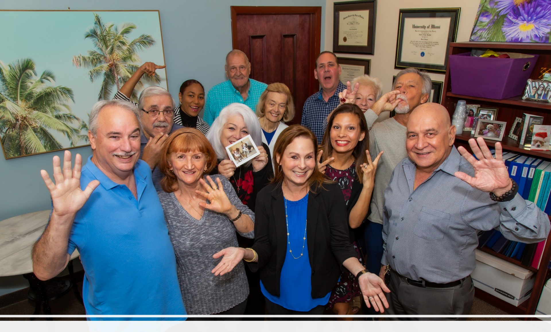
We look forward to meeting you